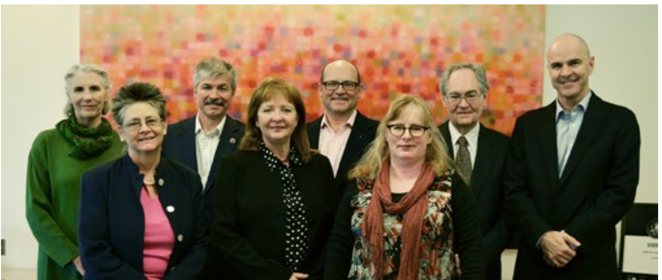
The Trustees of the John T Reid Charitable Trusts

The John T Reid Charitable Trusts fund small, medium and large organisations, and the size of each grant is considered in terms of the ability of each organisation to manage that grant, and the other sources of funding available to them. This means that the Trusts do not have upper and lower limits to the amount of their grants, nor is it relevant to consider the "average size" of our grants.