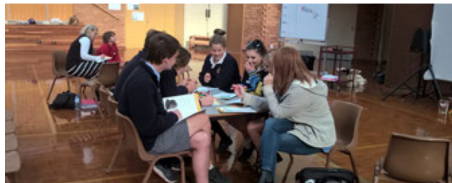
VICTORIAN STUDENT REPRESENTATIVE COUNCIL – LAKES ENTRANCE SCHOOL COMMUNITY.