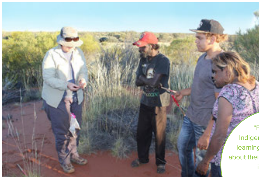
YOUNG MEMBERS OF THE TJIRRKARLI COMMUNITY ASSISTING WITH TRAP CHECKING.

Funds from the Trust contributed to two young faunal experts attending the project, providing educational materials for the students, the purchase of a night camera and bat trap, and part-funded a computer-linked microscope.