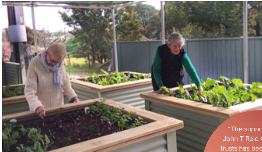
RESIDENTS UTILISING THE RAISED GARDEN BEDS AT CURRIE PARK ESTATE.

Not only is the garden just about produce but the opportunity to bring people together for a chat, for exercise, and overall well-being, assisting in the fight against depression, anxiety, and dementia.