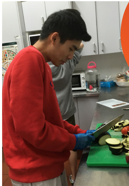
LIVING SKILLS PARTICIPANT.

Funds from the John T Reid Charitable Trusts have provided the Living Skills Program with facilitation, resources, activity costs, excursions, workshops, marketing, administration and evaluation.