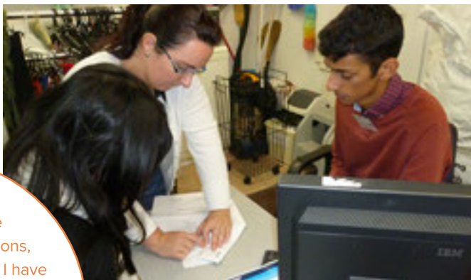
TRAINEES AT THE BENTLEIGH OP-SHOP.

"This was one of the most delightful applications, interviews and grants that I have been involved with in my 15 years with the Trust. A wonderful organisation that ticks all the boxes"